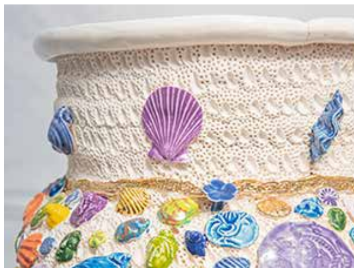
Image: Glenn Barkley, thatisnocountry4oldmen (sailing2byzantium) (detail), 2022. Photograph by Greg Piper; Bridget Willis, Gathering , 2023. Photograph by Greg Piper.

Both exhibitions are open 10:00am to 4:00pm daily, free admission. See hazelhurst.com.au for opening hours over the festive period.