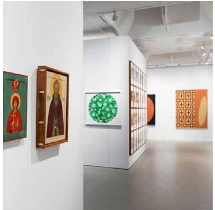
Image: Logos / Λογότυπα , installation view.

Curated by Kon Gouriotis OAM, the exhibition is presented in collaboration with Hazelhurst Art Centre's neighbour, Fr. Constantine Varipatis of Saint Stylianos Greek Orthodox Parish.