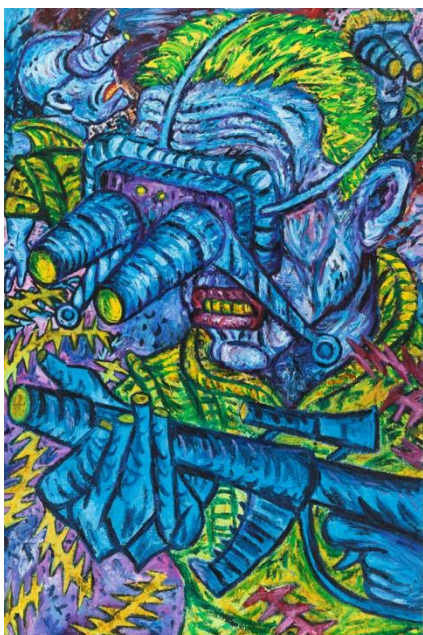
Night Vision 1993–94

Many of these works were included in Gittoes' groundbreaking solo exhibition The Realism of Peace which opened at the Museum and Art Gallery of the Northern Territory in 1995 and toured nationally until 1997.