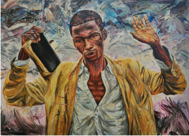
The Preacher II 1995