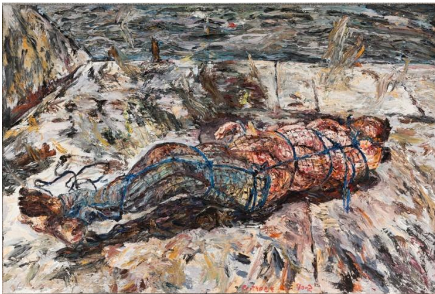
Salvage 1989–90 oil on canvas, 170 x 250cm