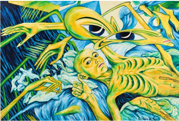
The Yellow Room (Afghanistan) 1999