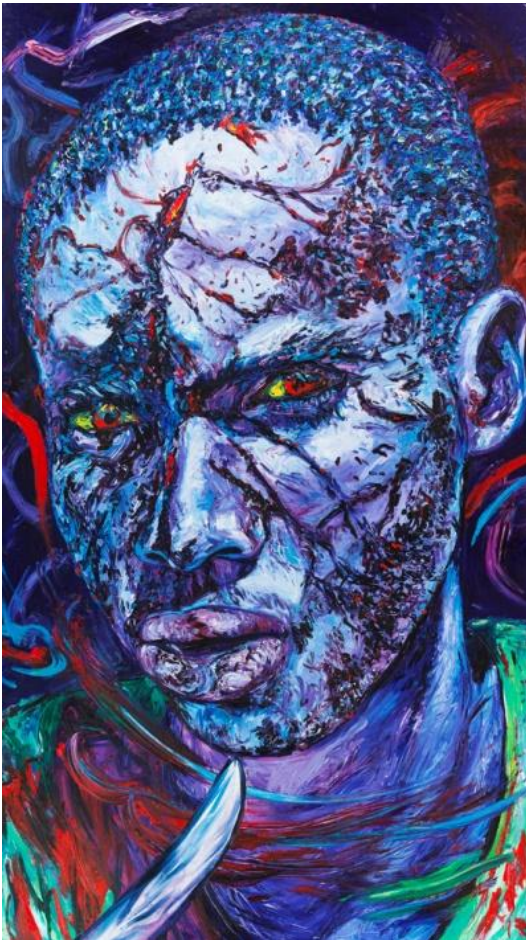
Blood and Tears 1997 oil on canvas, 305 x 172 cm

Kibeho, Rwanda Diary entry: 22 April 1995