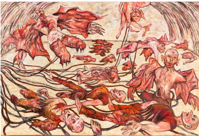
Descendence 2010–11 oil on canvas

The Descendence stories belong to a much larger work called Night Vision , which is a trilogy of three graphic novels yet to be published. Virus Squad and Corporal Night feature in this three part epic, which draws upon his experiences in the other worlds as well as the wars of this.