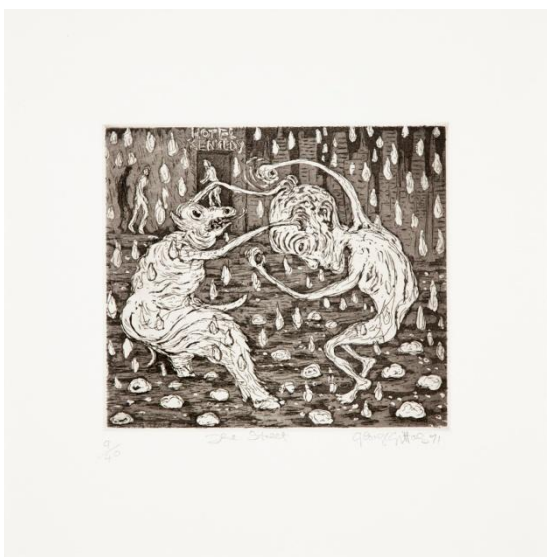
The Street 1971 etching, aquatint

In 1972 Gittoes established a studio at Bundeena on the outskirts of the Royal National Park south of Sydney. His art practice was influenced by the light-filled waters of nearby Port Hacking and the patterns of bush in the National Park. He also met and began working with visiting Aboriginal artists from Mornington Island off the northern coast of Queensland, leading to an exploration of several aspects of Aboriginal culture. These two influences led to his development of the Rainbow Way series which was inspired by the Aboriginal creation myth of the Rainbow Serpent and based on themes of the sea and the physics of light.