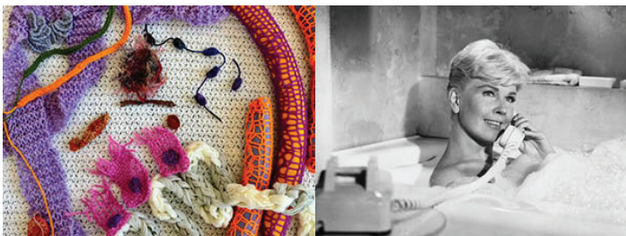
Pillow Talk, Univeral Pictures, 1959.

Annual membership $75.00, or $70.00 for Friends of Hazelhurst members. Join at the Hazelhurst Admin Desk or by phone. You must be aged 18+ to join.