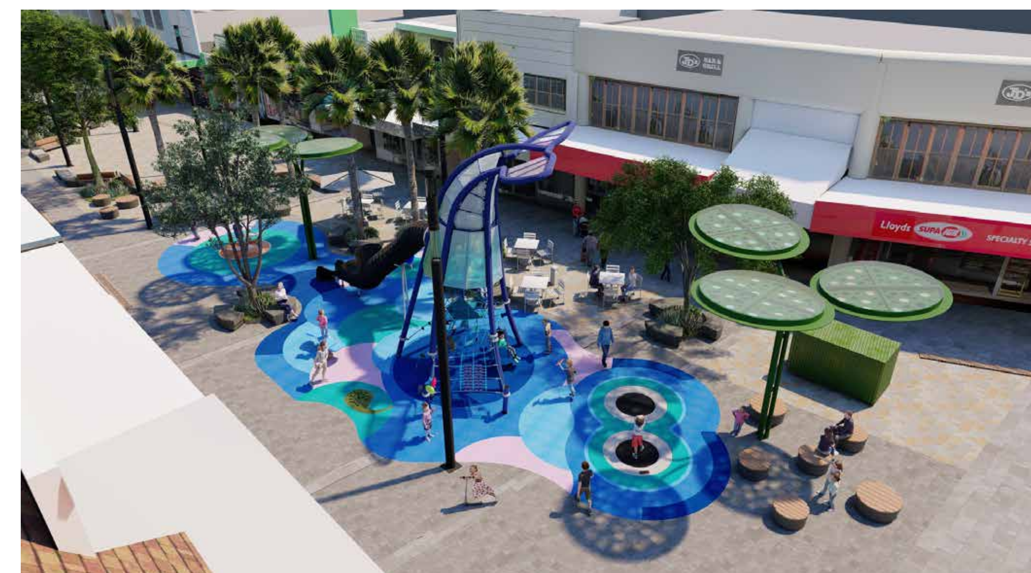
1. SOUTHERN PLAYGROUND