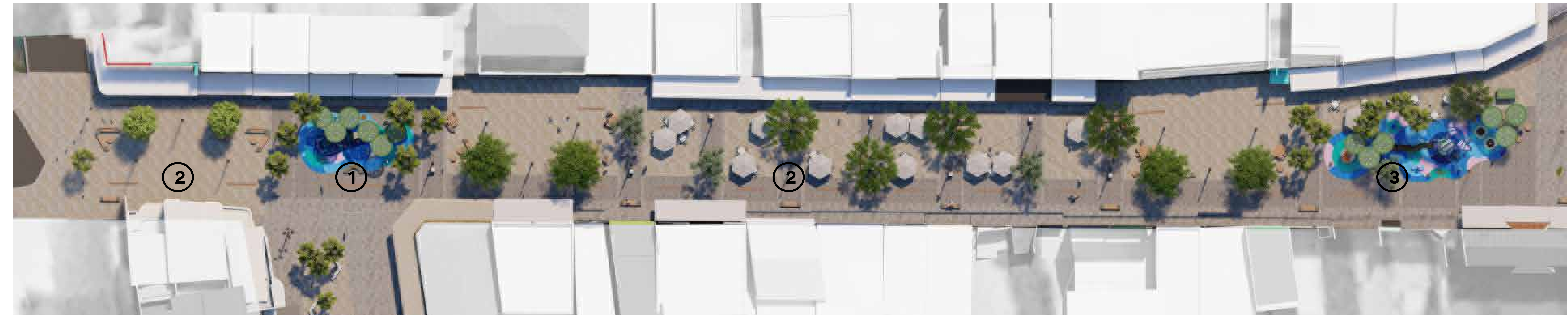
OVERALL PLAN - STAGE 2B WORKS